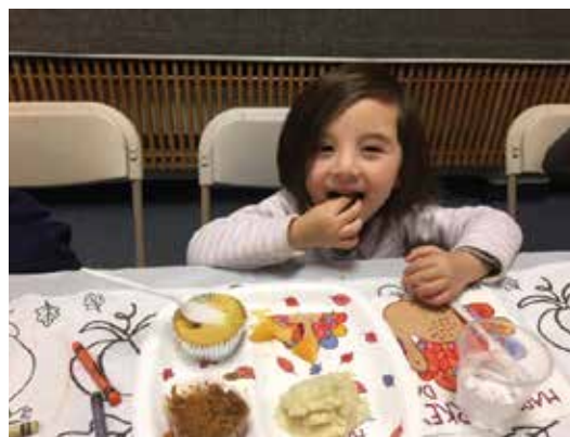
Thanksgiving at AJ Preschool and Infant Center