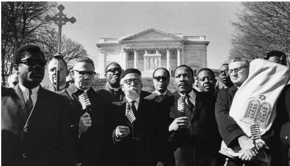
Photograph from the 1965 march in Selma, Alabama.