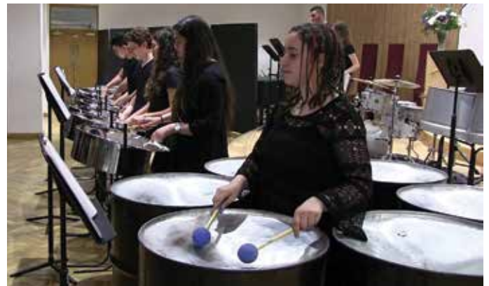
Made possible by the Hebraic Arts Music Series.